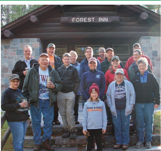
Pictured: Volunteers from a previous GreenTouch Event hosted by Itasca-Mantrap.