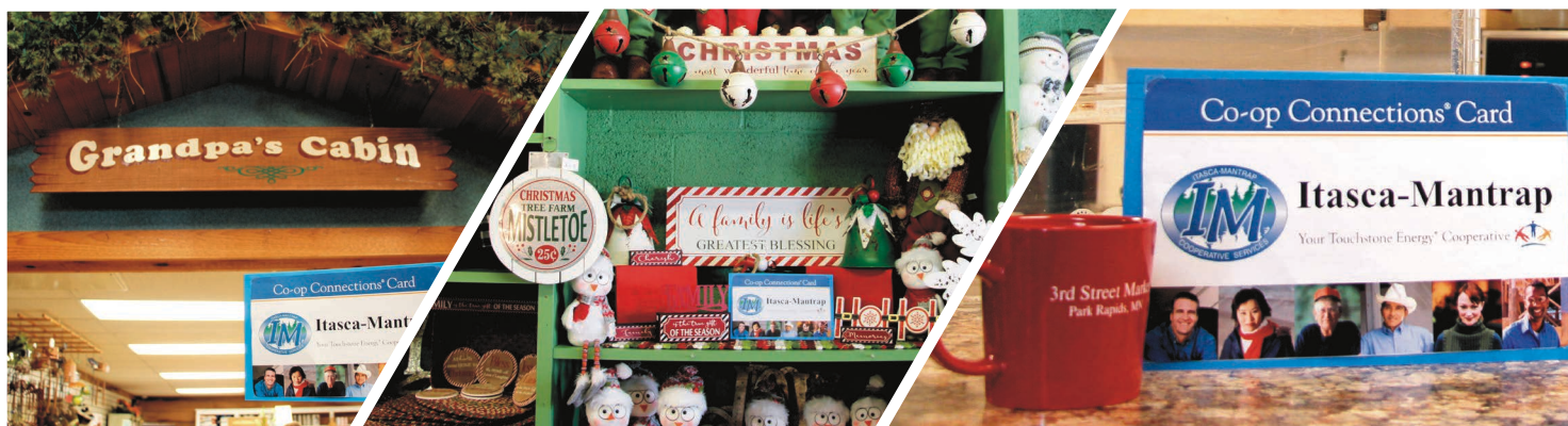
Pictured (L-R): Aunt Belle's Confectionary (Grandpa's Cabin), Amish Oak & Americana Furnishings, and 3rd Street Market.