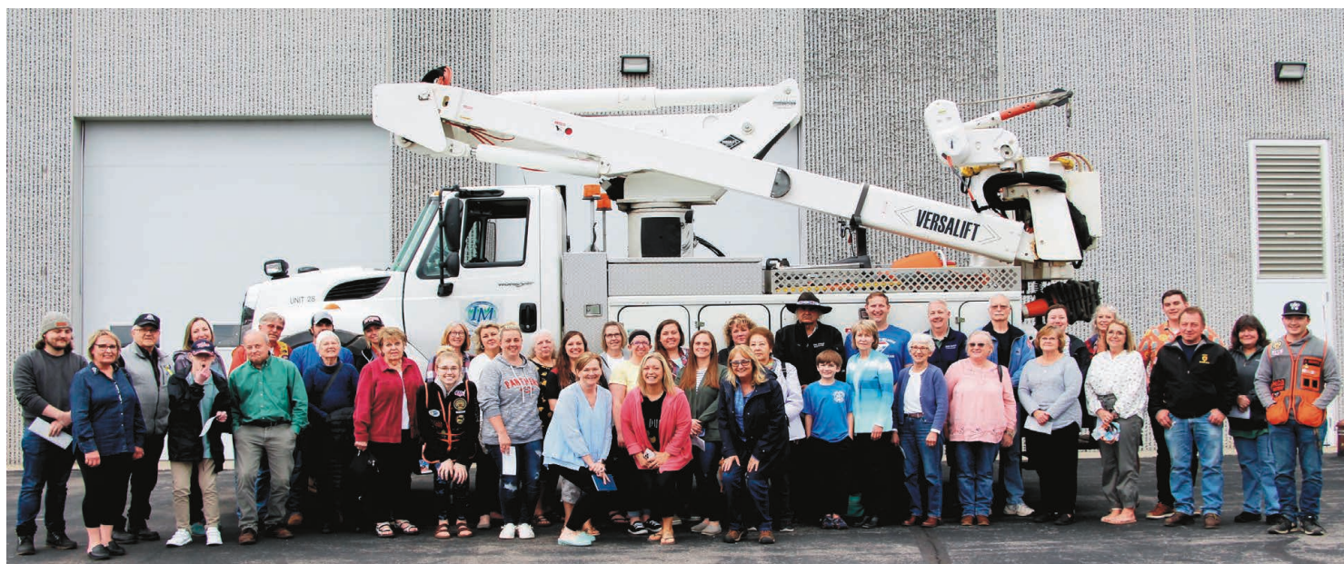
Operation Round Up grants were distributed to participants at Itasca-Mantrap on May 12, 2022.

Thank you for allowing me to serve you!!