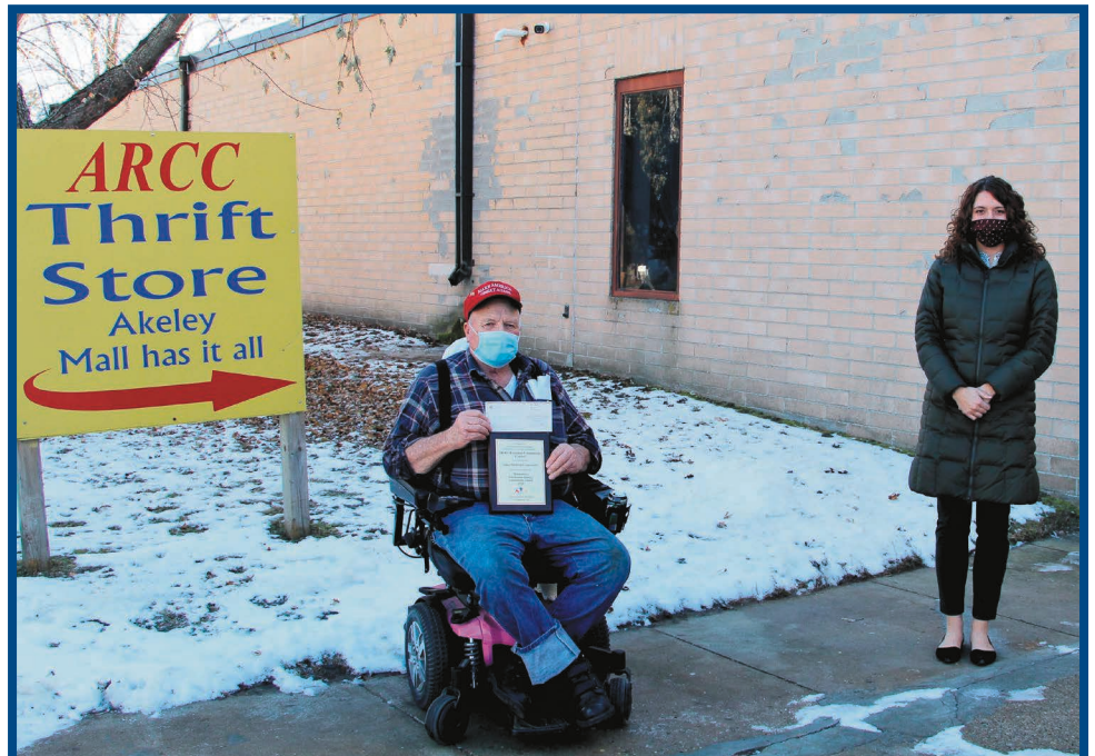
2020 Touchstone Energy Award winner: Akeley Regional Community Center (ARCC).

The award recipient will be announced in November and will then contend for the statewide Touchstone Energy Community Award, which has a cash prize of