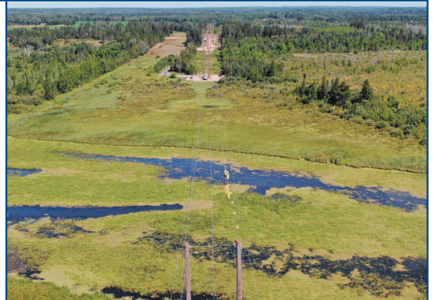
Drone footage shows the vegetative wetland that required Great River Energy to use the technology to complete part of a transmission line project.